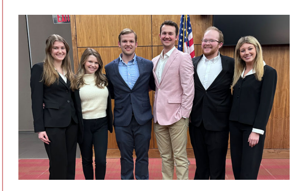
IISE Student Chapter Officers

Recently, we had the privilege of hosting two significant conferences that showcased the excellence and innovation within the field of industrial engineering. The IISE (Institute of Industrial and Systems Engineers) Regional Conference and